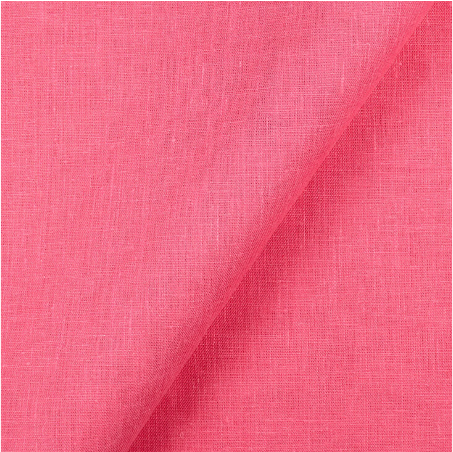
FS Midweight HONEYSUCKLE Softened 100% Linen

Caulfield was born in 1936 in Acton, London. He studied at London's Chelsea School of Art and graduated in 1960, before going on to study at London's Royal College of Art shortly after David Hockney and R.B. Kitaj, artists who would become fellow Pop contemporaries in the years to follow.